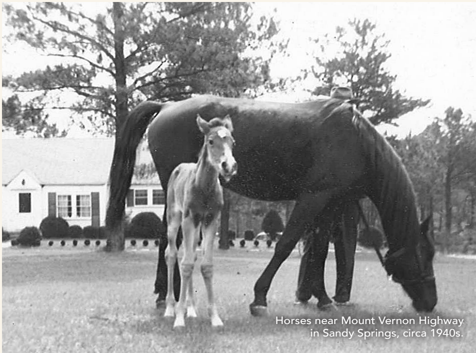
Horses near Mount Vernon Highway in Sandy Springs, circa 1940s.